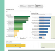
Individual Talent Reports