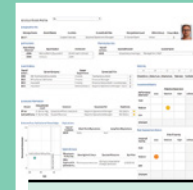
Individual Talent Maps