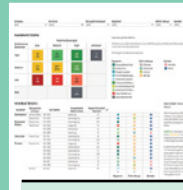
9 Cell Analytics