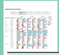
Engagement Level Reports