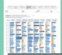
Identify Strength Profiles